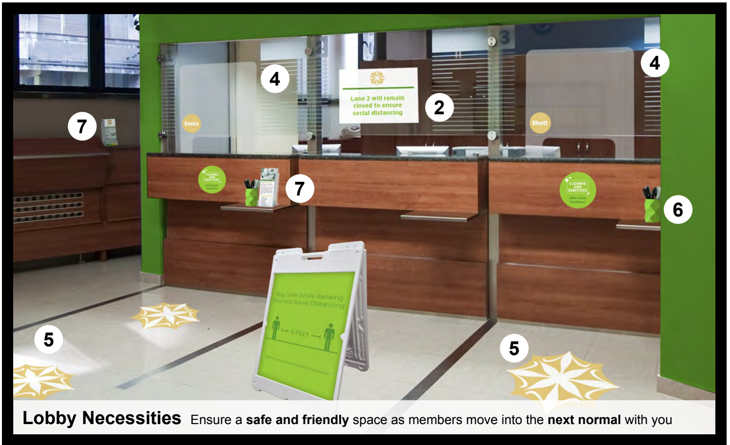
Lobby Necessities Ensure a safe and friendly space as members move into the next normal with you

4 | ACRYLIC PARTITIONS Made of clear material that can be disinfected regularly. Standard slot foot or bent bottoms as well as custom sizes are available with an access space integrated in the design.